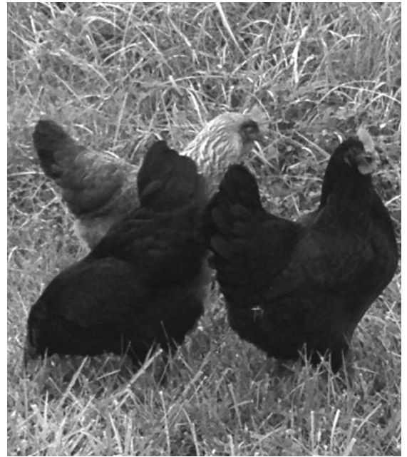
Free-range chickens at the Club's field trip to Elysian Fields Farm, fall 2014.