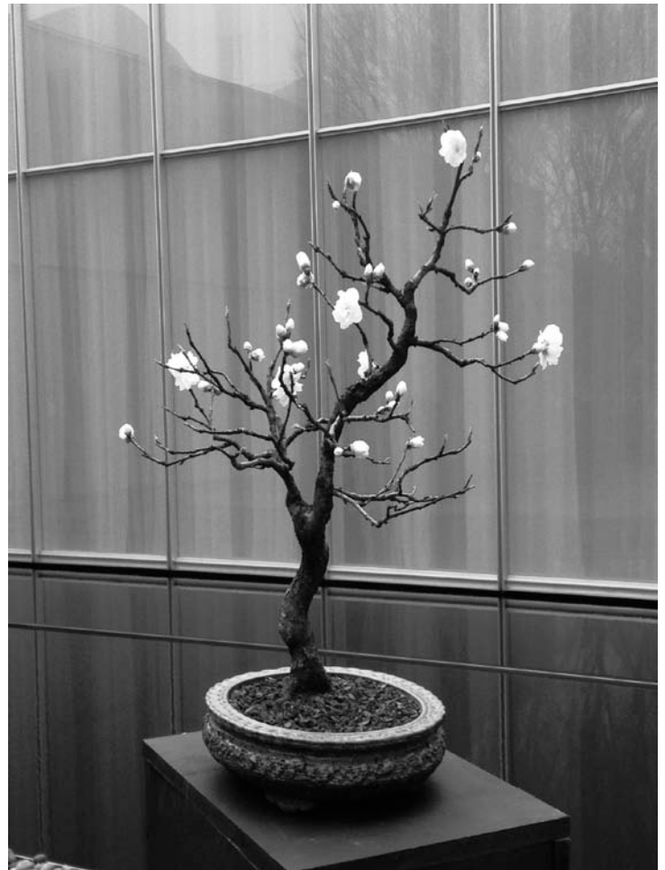
Bonsai in bloom at the N.C. Museum of Art, March 2015. The Blossoms will explore "The Art of Bonsai" at its February meeting.