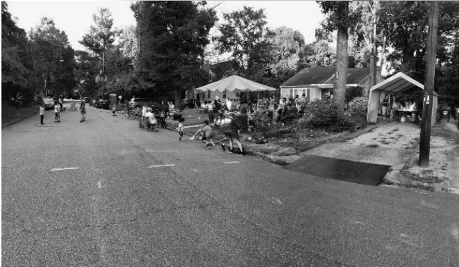
Neighbors enjoy a block party on Woodland Dr.