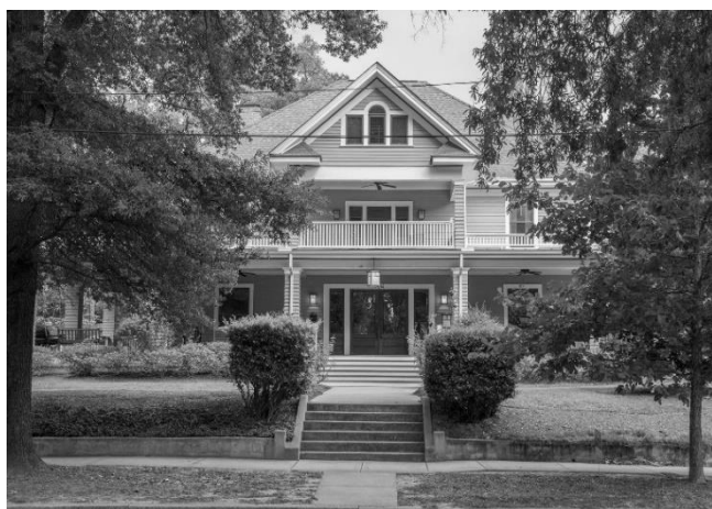
On N. Buchanan Street see a 1909-1910 home built for a Trinity College professor and his wife, a reminder of the influence the university and the Dukes had on Trinity Park in the early years.

It's that time of year when you get to peer behind your neighbors' doors, step inside, and admire the craftsmanship, decor, and renovation that may have caught your eye from the outside. Yes! For those of you who have been waiting since the 2016 tour and for new neighbors who have arrived since then, the 2018 Trinity Park Home Tour will take place on Sunday, October 14 th from 11am to 5pm.