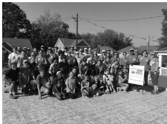
Some of the 76 families of Neighbors for Habitat volunteers

With participation from 76 families, Neighbors for Habitat (N4H) raised $77,854 in 2017 and helped build a house at 2607 Angier Ave. On alternate Saturdays from May through September, we formed volunteer crews to hammer, saw, and paint. We