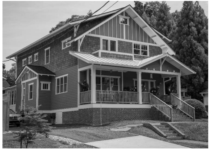
Representing more recent history is a home built in 2017 on Englewood Avenue. The overall mix shows how Trinity Park houses, like its residents, are diverse, and a sum greater than their parts alone.

Tour participants will be able to go inside each home to see what owners have done with them over the years, whether that's keeping original features, updating them, or replacing parts with features that work better for the 21st century.