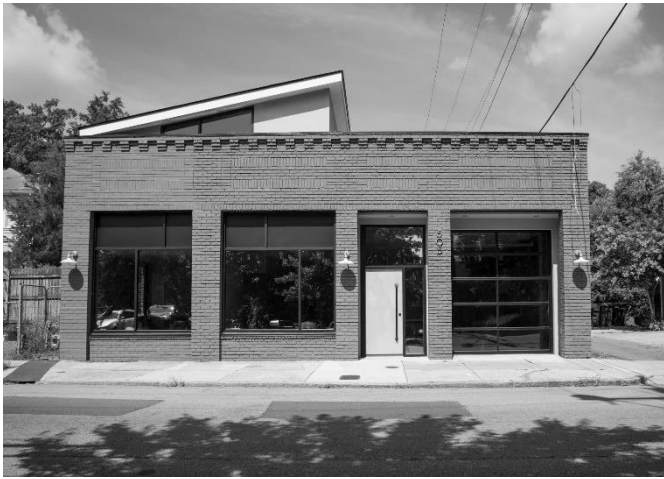
On Gregson Street, view the former Piggly Wiggly grocery store now converted to a residence with a roof deck. Come see the transformation and learn about the building's decades-long commercial history.