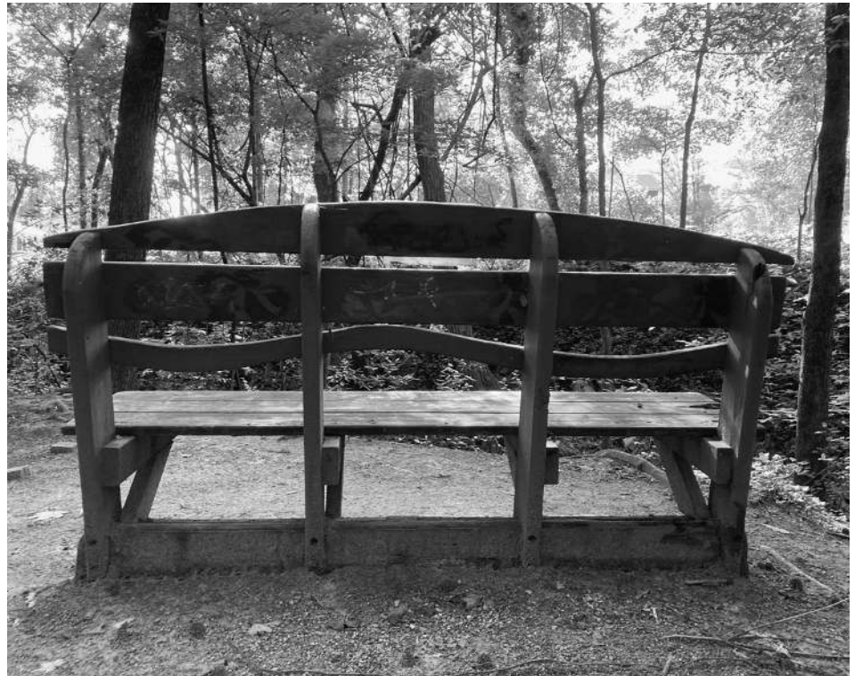
Thanks to the Pearl Mill Preserve stewards for painting the creek-side benches!