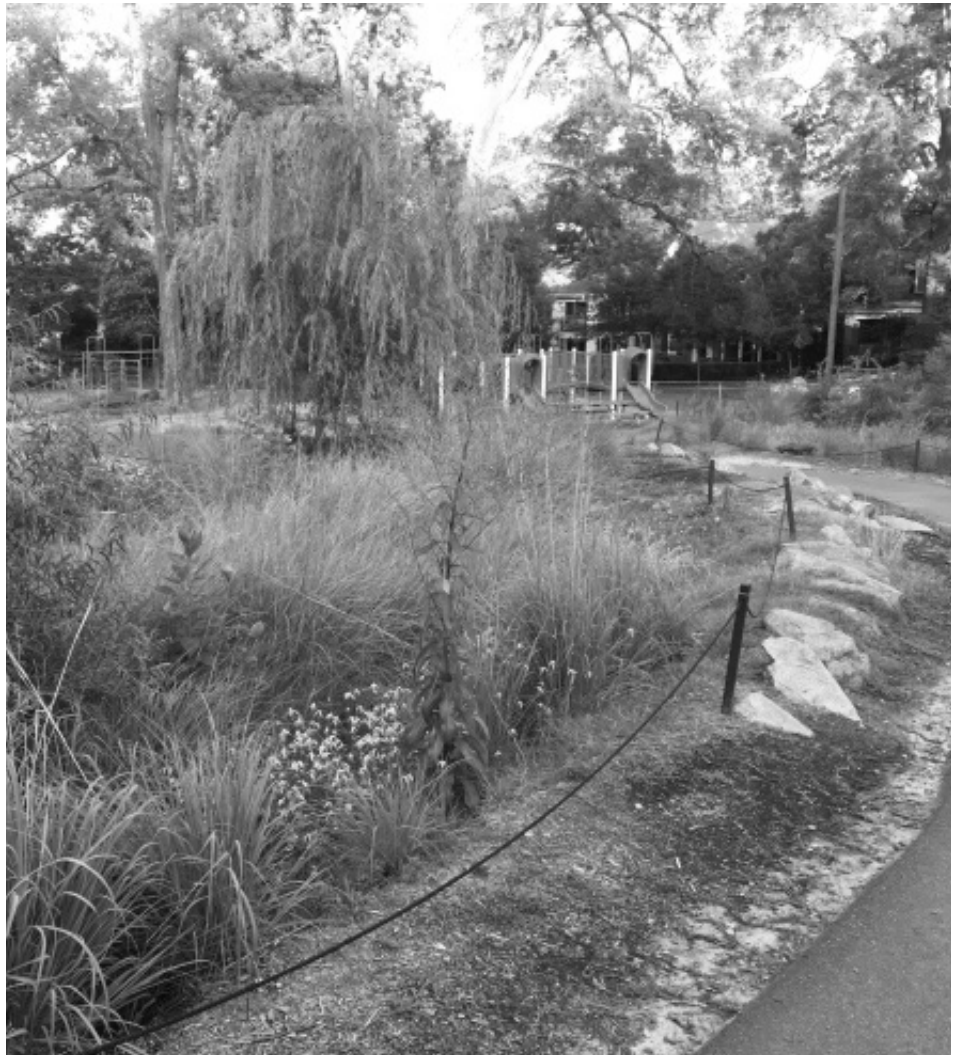
Rain gardens at the George Watts playground with paved walking trail

With the George Watts PTA, our grant will help repair the rain gardens on the school playground. The rain gardens protect the playground and downhill areas of the neighborhood, including Ellerbe Creek, by preventing soil erosion during rainstorms, and slowing and filtering runoff. They are also beautiful and are used extensively by the general public outside of school hours. They make a great gathering spot in late afternoons and evenings, weekends, and summertime! The Ellerbe Creek