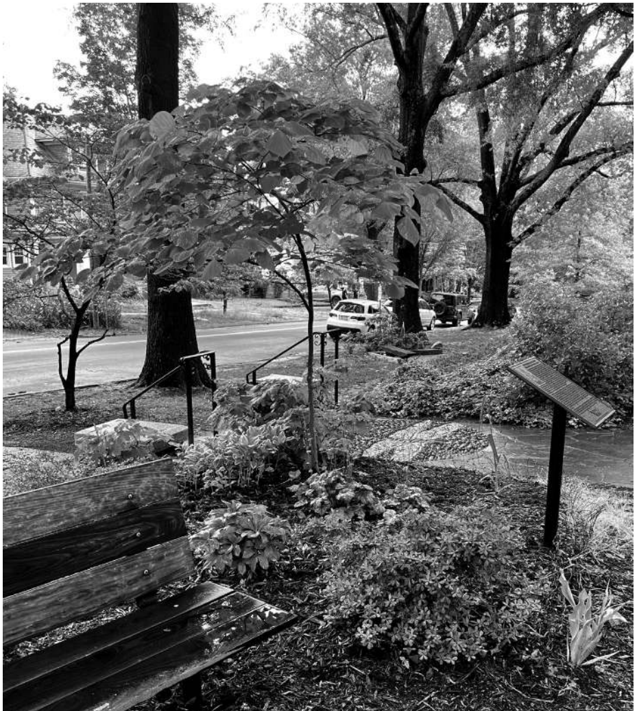
Gardens in The Trinity Park

donation to the Foundation. We are immensely grateful for their ongoing support. Please visit the Foundation's website at trinityparkfoundation.org if you would like to make a one-time or ongoing donation, or send a check to The Trinity Park Foundation, Inc., P.O. Box 725, Durham, NC 27702. If you have ideas for capital improvement projects within our neighborhood, email the Foundation Board at trinityparkfoundation@gmail.com .