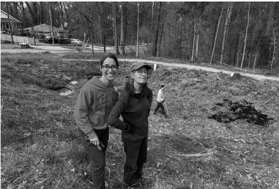
Both images: Volunteers tending the Pearl Mill bioretention site on March 22 workday

THANK YOU to the ~20 volunteers who pitched in on March 22 to clean up the Pearl Mill bioretention. Volunteers came from at least five other neighborhoods in addition to Trinity Park: Old North Durham, Watts Hospital Hillandale, Northgate Park, Tuscaloosa Lakewood and Duke Park! Our crew spent the morning removing weeds, dead plants, trash